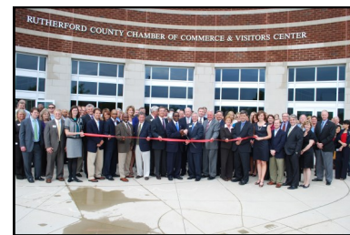
The Rutherford County Chamber celebrating the ribbon cutting of the Visitors Center and Chamber offices in 2011.

Benefits of being a Chamber Diplomat include: meeting decision-makers on a professional basis, receiving recognition throughout Rutherford County's business and professional community, career development through training events and increases business opportunities through networking events.